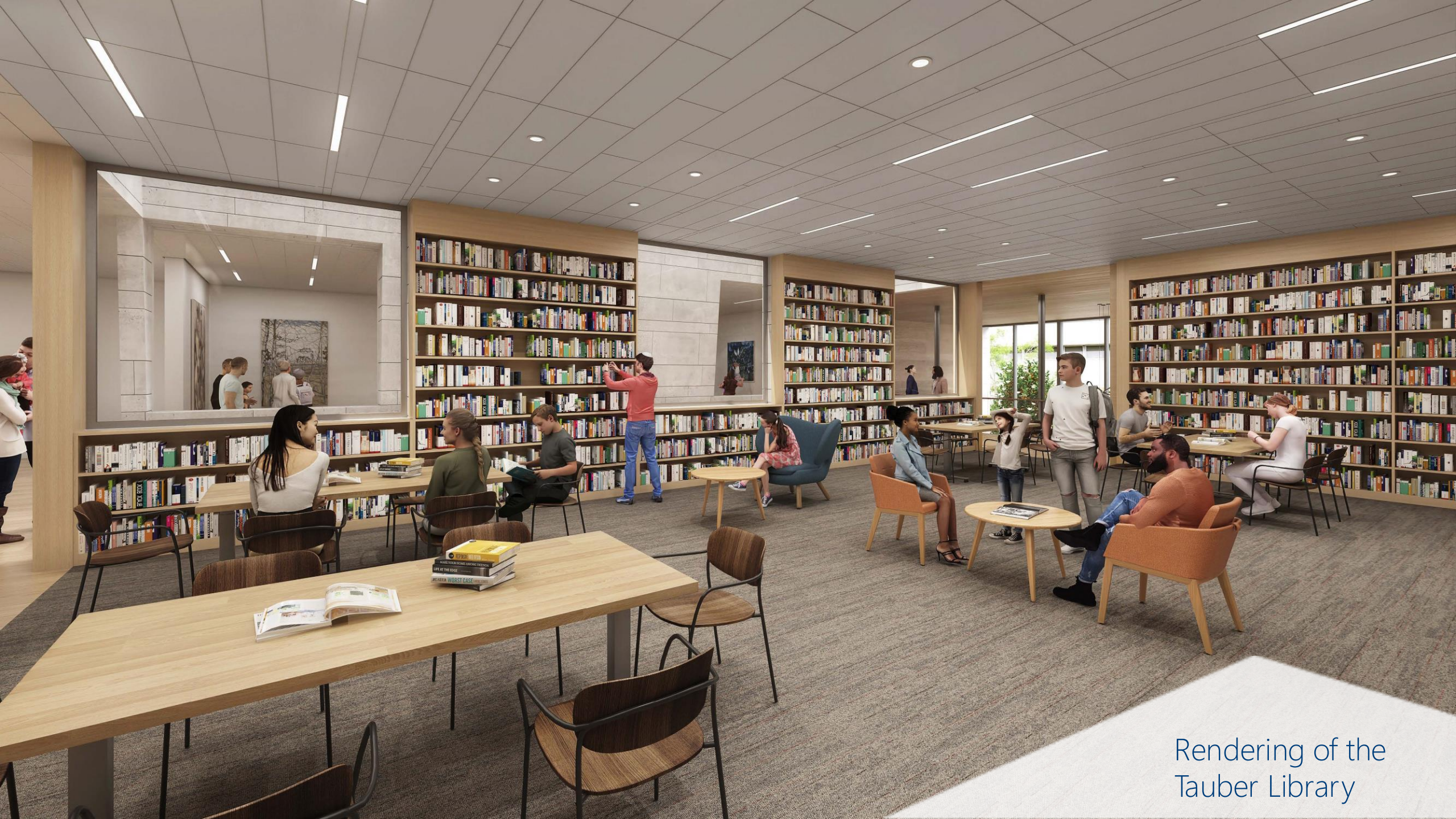
Rendering of the Tauber Library