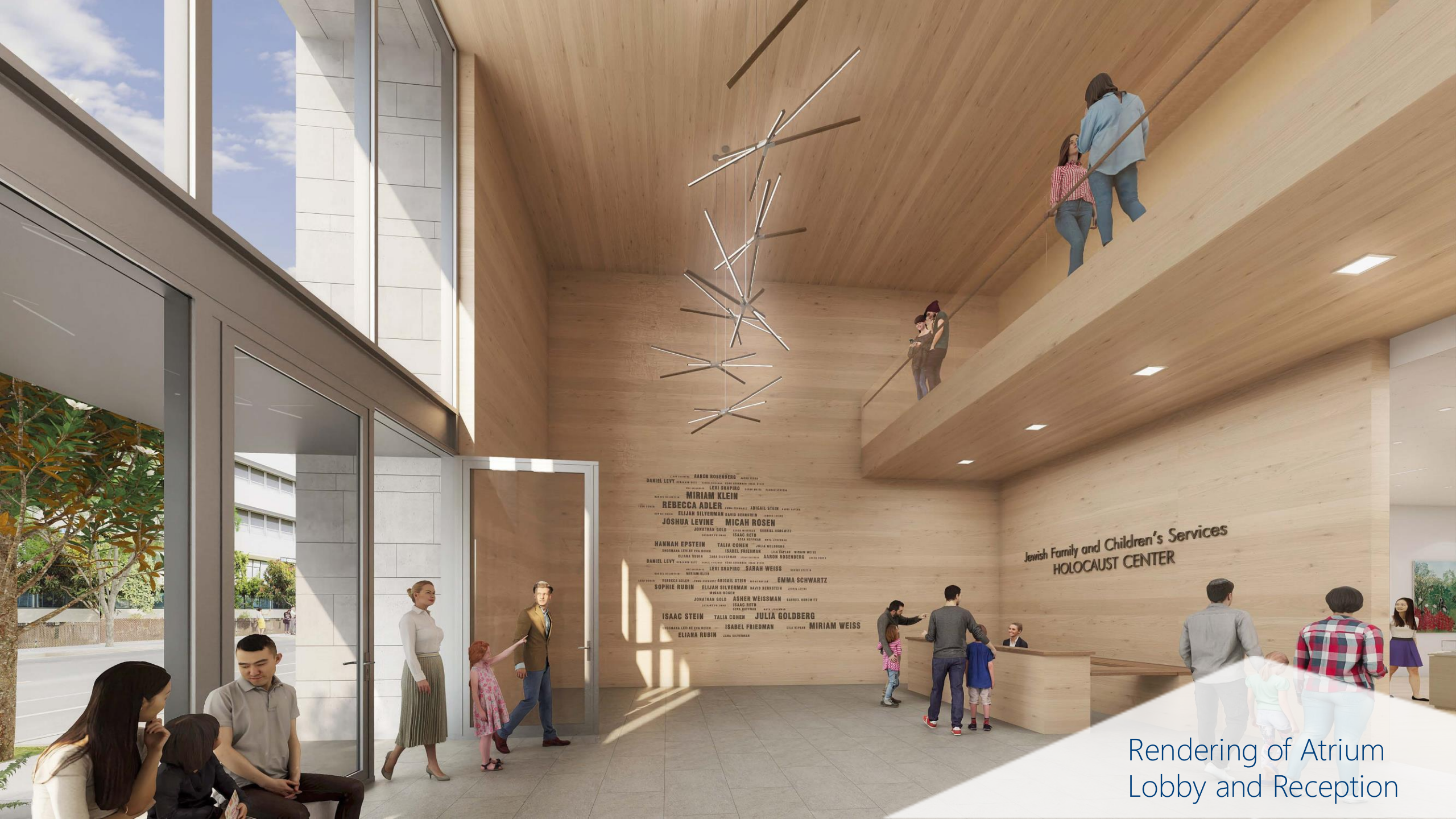
Rendering of Atrium Lobby and Reception