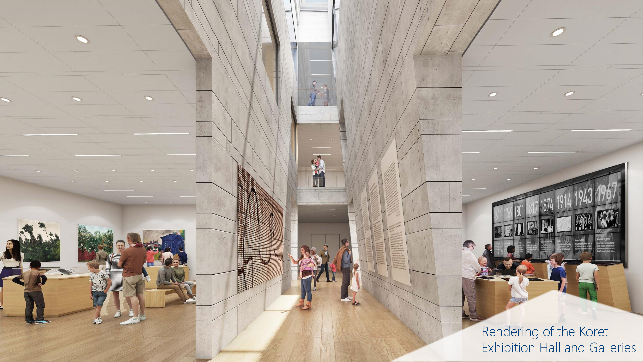
Rendering of the Koret Exhibition Hall and Galleries