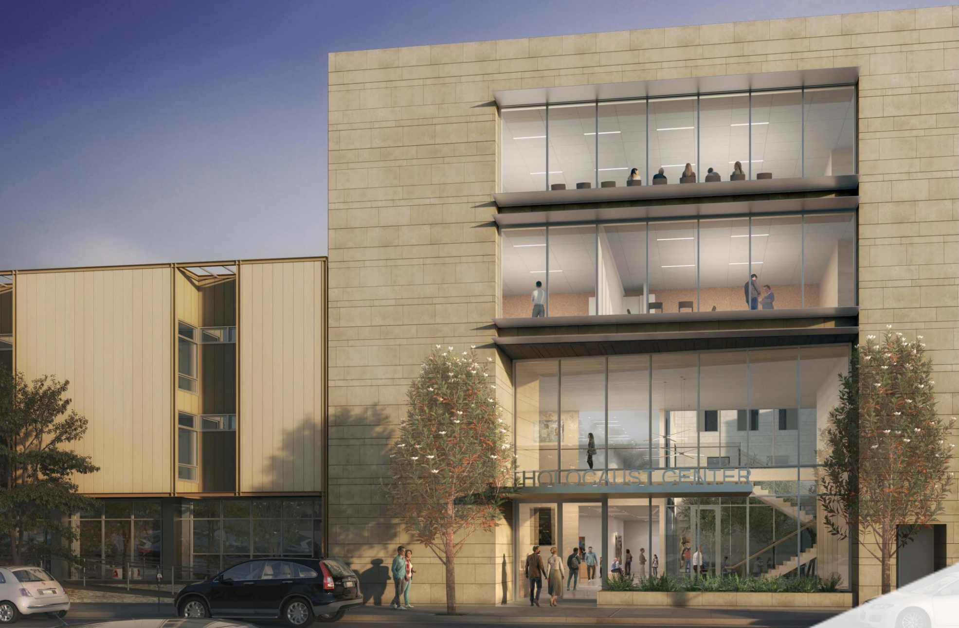
Rendering of JFCS' new 4-story Holocaust Center