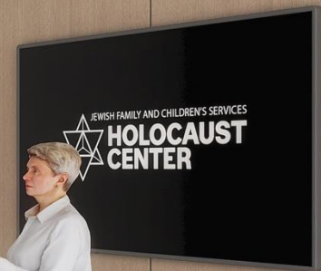
Education and Curriculum Development Center Design