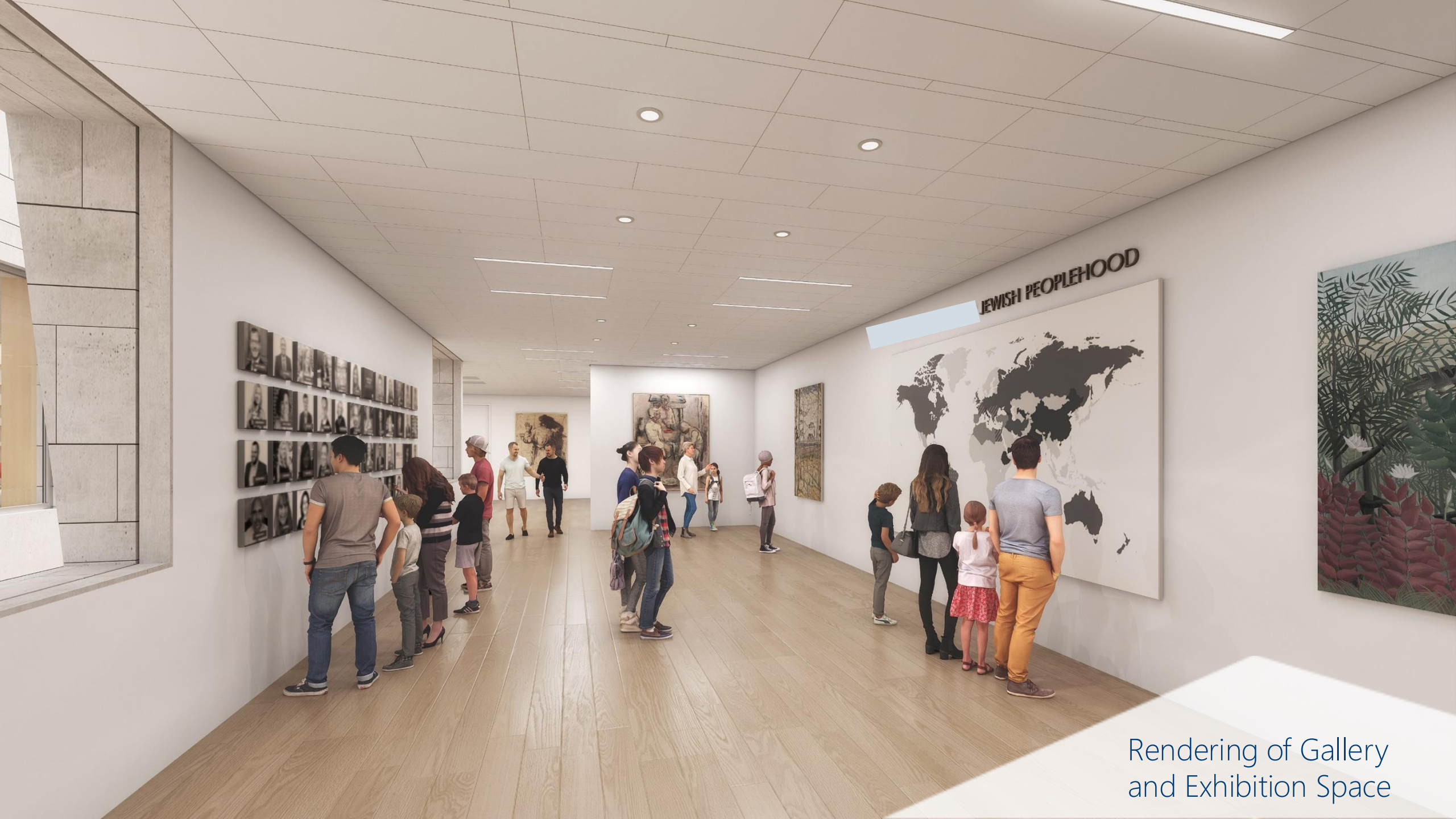
Rendering of Gallery and Exhibition Space